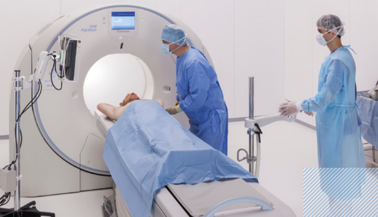
Toshiba's Aquilion ONE GENESIS