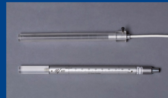
CT dosimetry with an ionization chamber and a solid state detector