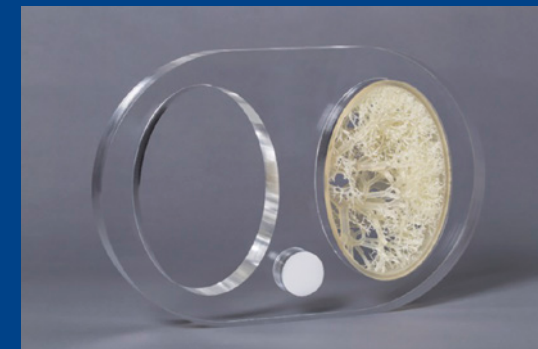
Lung phantom with 3D printed insert